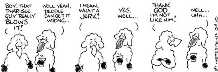
www.AGNUSDAY.ORG LUKE 18:9-14 Agnus Day appears with the permission of www.agnusday.org

WCDSB is currently accepting applications for Occasional Teachers. Please visit our website for job details and application criteria: www.wcdsb.ca